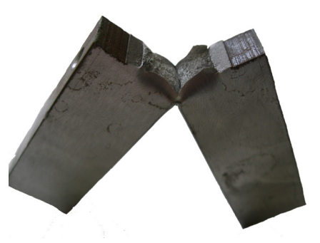
Figure 1 – Specimen after testing for static crack resistance.

Laboratory research on static crack resistance gave high results. They are shown in Table 6 below. Some specimens after testing were not broken. (Figure 1)