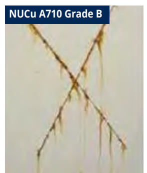
Figure 2. Painted Steel Corrosion Comparison [11]