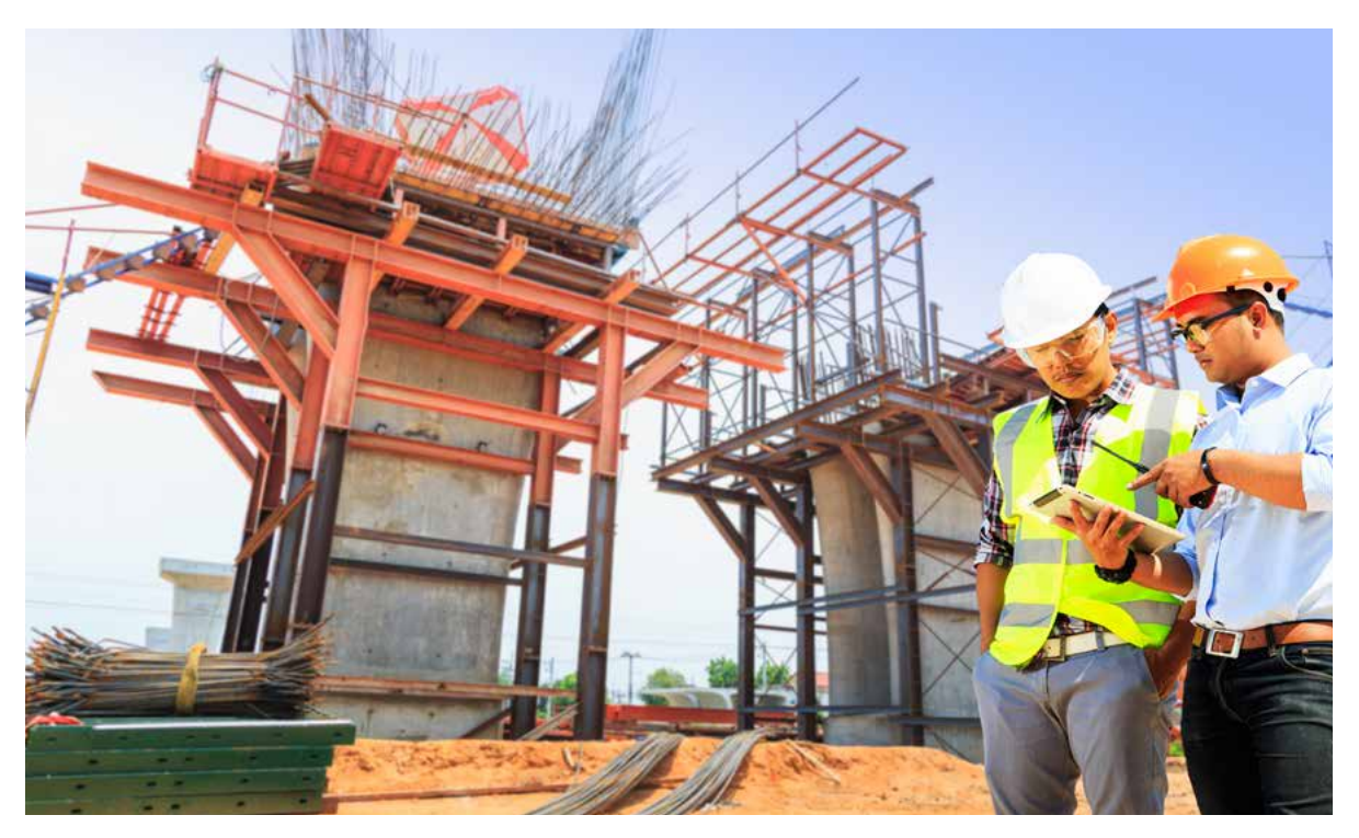
Nb-containing high performance bridge steels are providing engineers design flexibility, lowering initial costs through weight savings in transportation and fabrication, and resulting in life-cycle savings with fewer maintenance requirements and a longer service life.