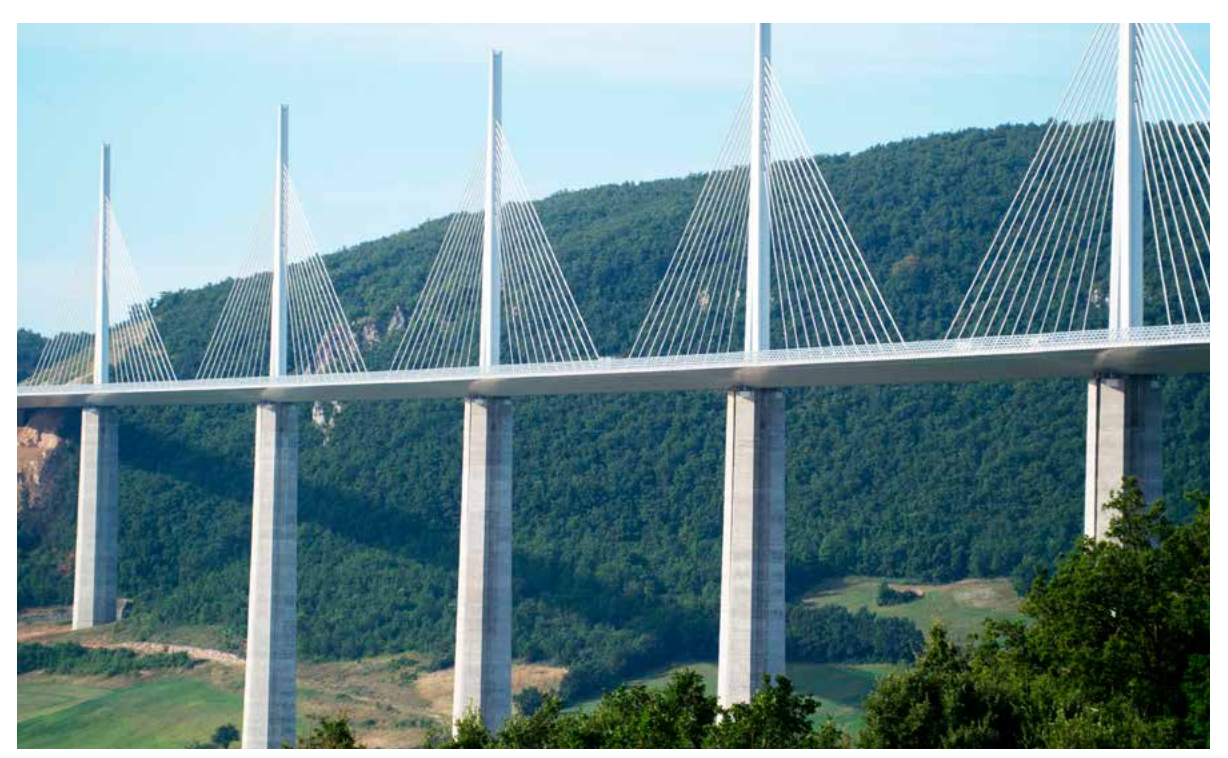
The Viaduct de Millau bridge in southern France stands as the tallest bridge in the world at 343 m (1,125 ft). Niobium was used at the rate of 0.025% per tonne of steel to reduce its overall weight by some 60 percent.