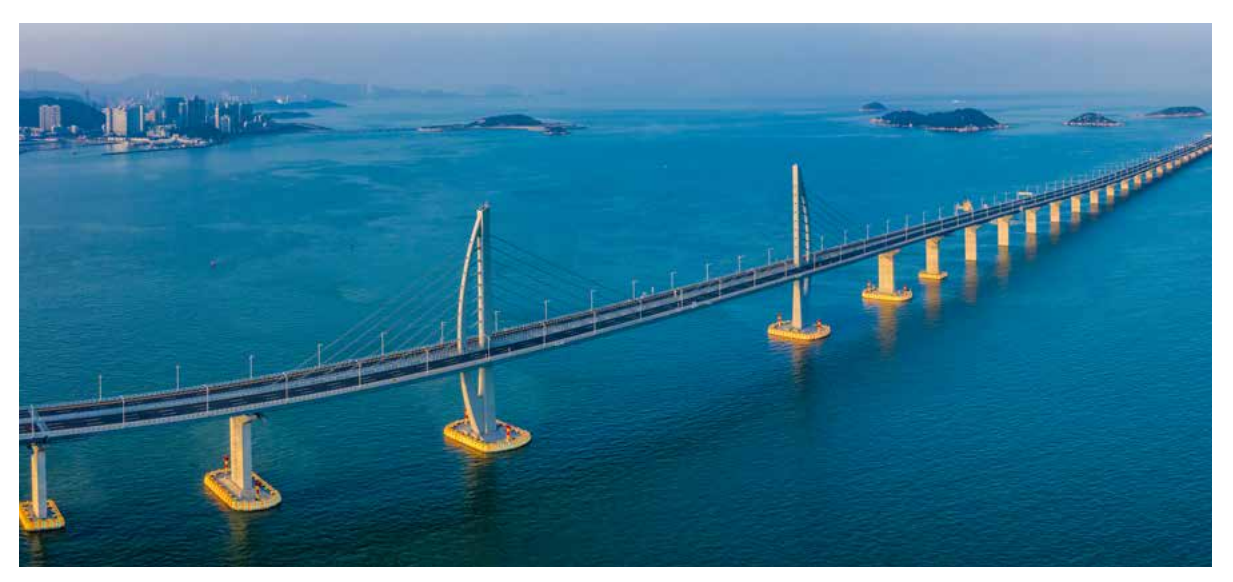
The Hong Kong- Zhuhai-Macao bridge is the world's longest cross-sea project at 55Km (34 miles), incorporating a bridge and a 6.7Km (4 miles) seabed tunnel. The HBIS Group optimized levels of vanadium, chrome, niobium and copper to provide high strength, anti-seismic wire bars with an unprecedented anti-corrosion ability used for the immersed tunnel construction.

*"HBIS Fine Steel Applied in Hong Kong-Zhuhai-Macao Bridge," HBIS Group, last modified 2017. http://www.hbisco.com/site/en/groupnewssub/info/2017/13455.html