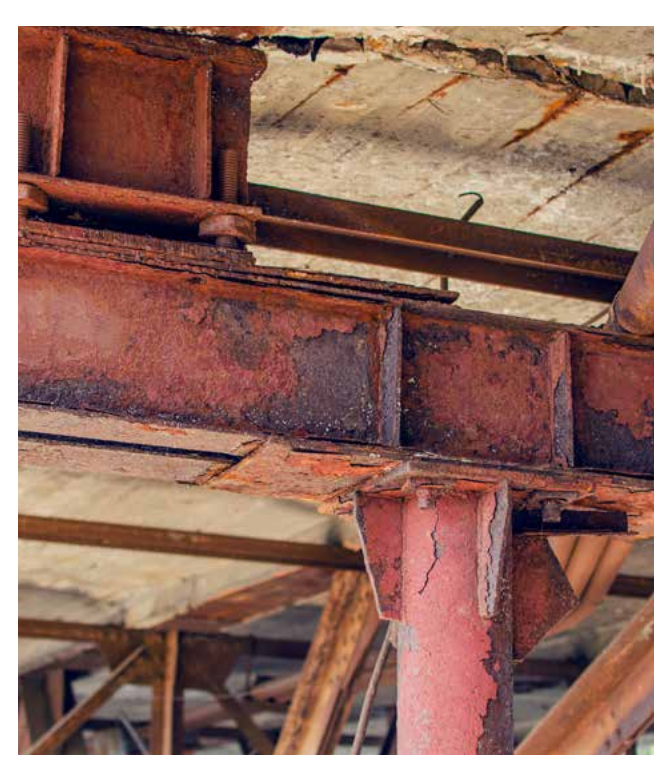
Decades of structural and material neglect, lack of budget, end of design life, and the effects of weather and hazard events have produced an urgent need for bridge replacement and rehabilitation throughout the United States and abroad with new and improved higher toughness and more corrosion resistant steels.

The original ASTM Standard G101 corrosion index, based on the work of Legault and Leckie [15], was used to predict if a steel is weatherable. They utilized a portion of an extensive database published by Larrabee and Coburn. [16] The ASTM Standard G101 was established to estimate corrosion resistance of low-alloy weathering steels derived from chemical composition data and actual atmospheric exposure tests. Many high strength, low alloy steels are currently used in the development stage with chemical composition ranges extending beyond those covered by the ASTM Standard G101. These steels may contain more nickel and copper or elements not included in the Standard G101. Being able to estimate the weatherability of these steels is of primary interest today. As a result, new equations have been added to the revised ASTM Standard G101 corrosion index. [17]